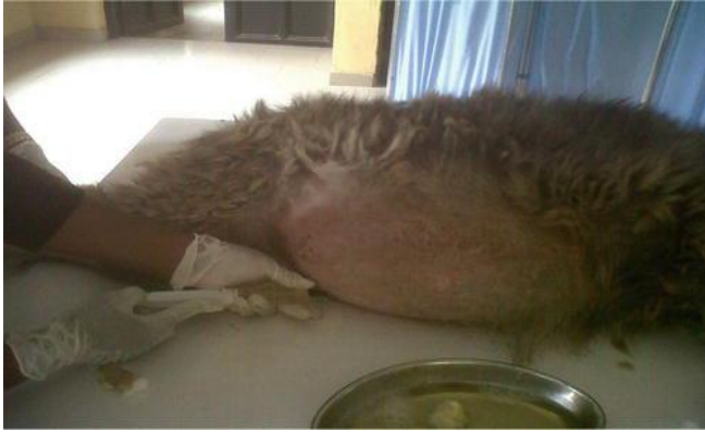
Ascites and removal of fluid